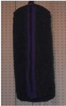
20. Round padded halter/bridle bag $30.00