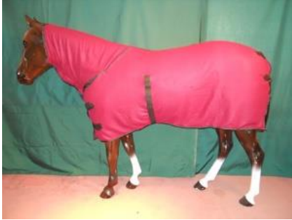
10: Polar Fleece Cooler