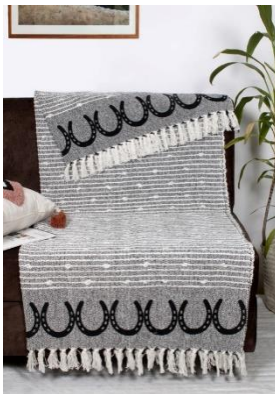
52: Cotton Throw (can be or natural) $24.00