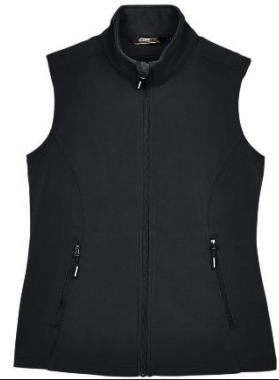
3: Soft shell vest Men's or Ladies $60.00