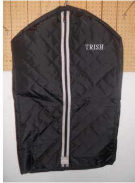
18: Quilted Garment bag $50.00