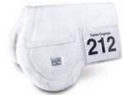
6. Fleece number pad $85.00