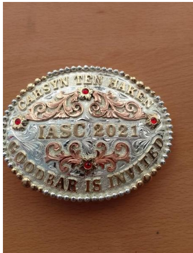
33 A Buckle

We have bettered our delivery time. If placed 6 weeks before banquet date we should be able to deliver at banquet time. If there is a problem we will contact and allow time to make a alternate award decision or you can ok the delivery time.