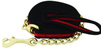
47: Padded lunge line: Black or red 20" chain. $24.00