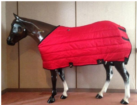
12: Chillbuster Blanket: Black only, trim : black, white, red, teal, purple, blue, navy