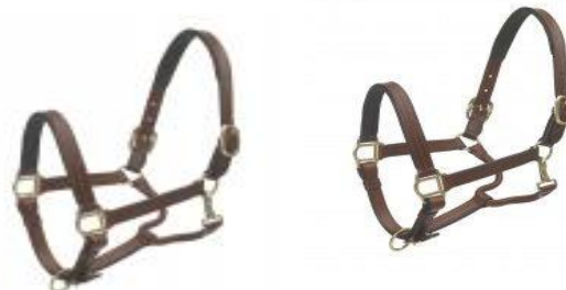
8. Economy leather halter $57.00 9. Triple stitched and padded $95.00

Leather halters come with a brass plate saying club name and winner's name or horses name.