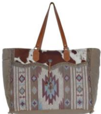
56: Myra bag Weekender Hair on hide and western Canvas. Includes club logo $46.00