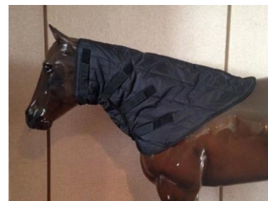
15. Faceless winter hood