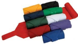
30: Standing wraps. Logo on one of the 4 wraps: $27.00

Bag Colors are: red, royal, navy, purple, black Trim colors on bags are: black or white