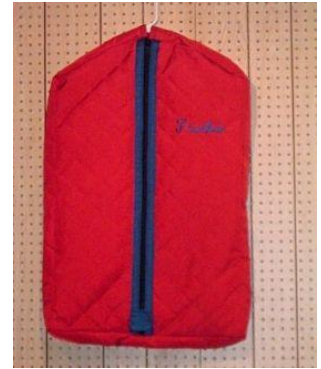
19: Quilted chap bag