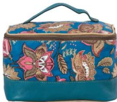
57: Myra bag. Make up bag. Floral and blue leather. Includes club logo. $22.00