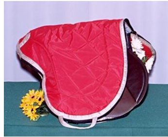
27: English saddle Carrier $ 55.00.