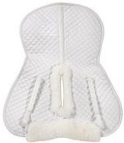
4: Half Pad with sheep skin lining $150.00 Club name. On billet straps