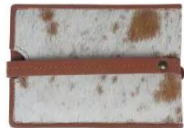
58: Myra bag luggage tag Hair on hide. Club logo included. $12.00