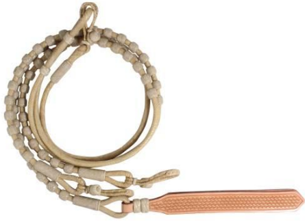
46: Romel reins. $139.00 Three colors available Natural, natural/black, natural/brown