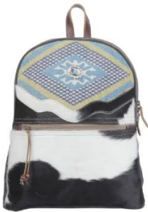
55: Cowhide backpack Includes club logo $60.00