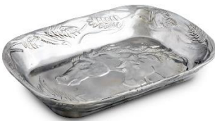
51: Horse catch all tray $28.00