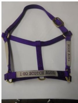
7: Nylon halter embroidered on all three sides $38.00. Colors: Red, navy, burgundy, royal blue, black, ft. green

Leather halters come with a brass plate saying club name and winner's name or horses name.