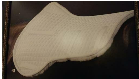
5: Next Generation Show Pad, High profile or regular profile $150.00 Club name on billet straps