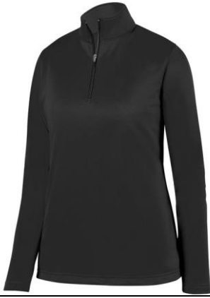
1: Wicking fleece lined quarter zip. Available Mens & ladies . Dk Gray, Navy, black $45.00