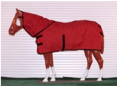
14: Summer Showcooler $68.00