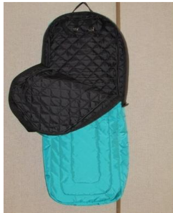
24: X-long padded bridle bag.