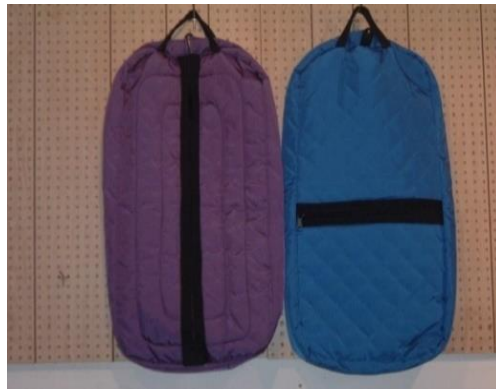
21: Deluxe Flat Bridle/ Halter Bag padded with pocket on the back $40.00