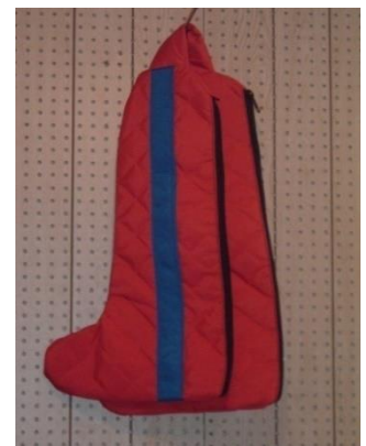
25: English or Western Boot Bag $30.00