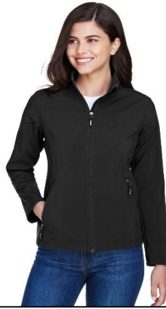
2: Soft shell fleece lined jacket. Men's or Ladies. $70.00