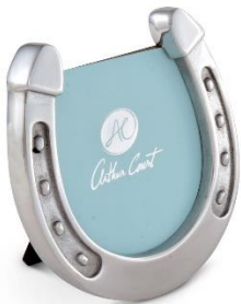
50: Horse shoe frame Photo 3 1/2 x 4 $32.00