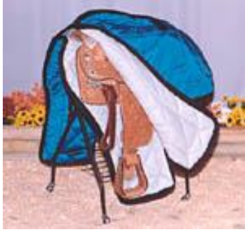
26: Western Saddle Carrier: $65.00