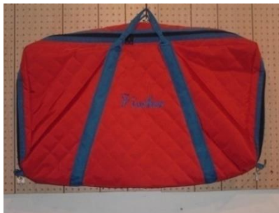
23: Saddle blanket carrier $48.00