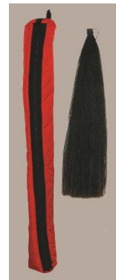
22: Tail Bag quilted $25.00 not quilted $17.00 (Doesn't include tail)