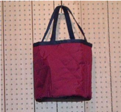
53:Groom tote complete with mane brush and 2 body brushes. $20.00