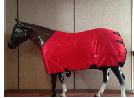
11: Fly Sheet $60.00 Black, red , royal