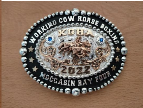
33 B Buckle