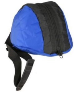
28: Helmet bag $30.00