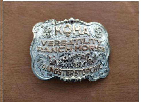
33 C Buckle