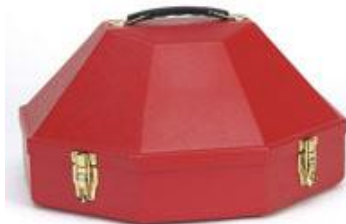
31: Western or English Hat Can: $59.00