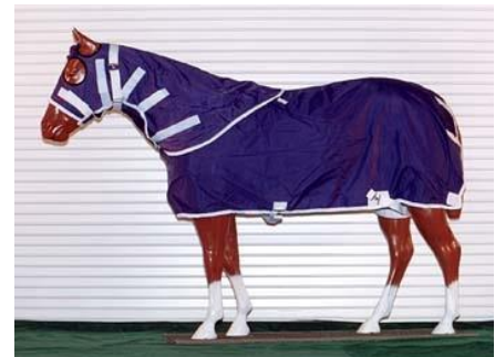
13: Summer Sheet: $50.00. Colors: Black, red, ft. green, navy , purple.