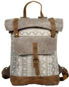
54: Back pack Will have logo and lettering included. $60.00